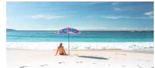
98 Depot Beach